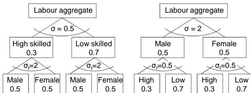
Figure 3: Two-level nesting options